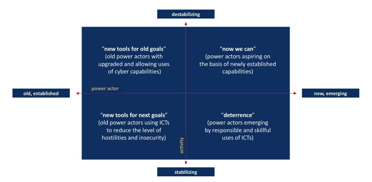
Figure 1. Stabilizing and destabilizing behaviour of established and emerging power actors. Authors' compilation.

We argue that the possession of national and military cyber capabilities does not automatically destabilize or stabilize international relations, or threaten peace, or encourage pacifying behaviour. <sup>48</sup> Beauty is in the eye of the beholder: our perceptions, schools of thought and political preferences determine the conclusion. However, we warn against two distinct beliefs: that cyber means, and digitalization in general, are dangerous; and that the use of cyber means in state power projection is harmless. Digitalization does improve and ease human and societal life. ICTs empower individuals and organizations. The setting where state cyber capabilities are being employed is age-old and unchanged. We are talking about human, societal, and politically conditioned environments where cognition and behaviour are uncontrollable. The first-level effects of cyber operations are not necessarily destructive, and their active use may remain undetected. However, the spill-over, second and nth-order effects and impact are unpredictable and should not be underestimated. Reckless, care-free and easy usage of cyber means may trigger latent and escalate on-going conflicts. It also leads to changes in the perceptions of normalcy and accountability.