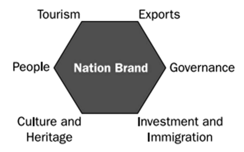
Figure 2. NBI's "Nation Brand Hexagon<sup>©</sup>." Source. Anholt (2005, 297).