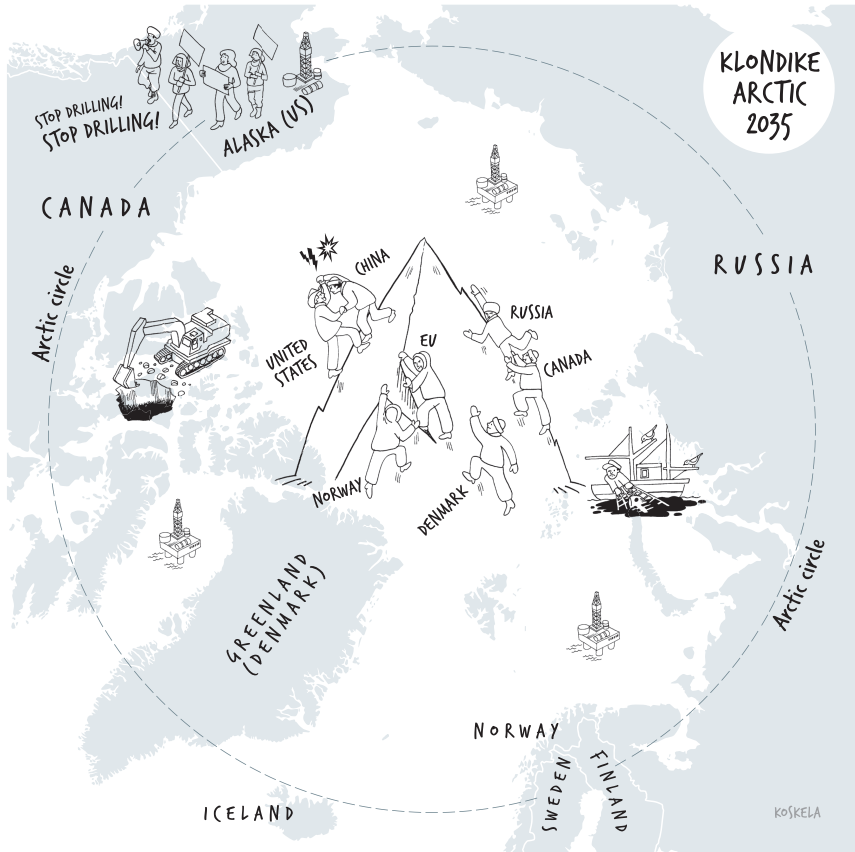
Figure 1.2 Illustration of the Klondike Arctic 2035.