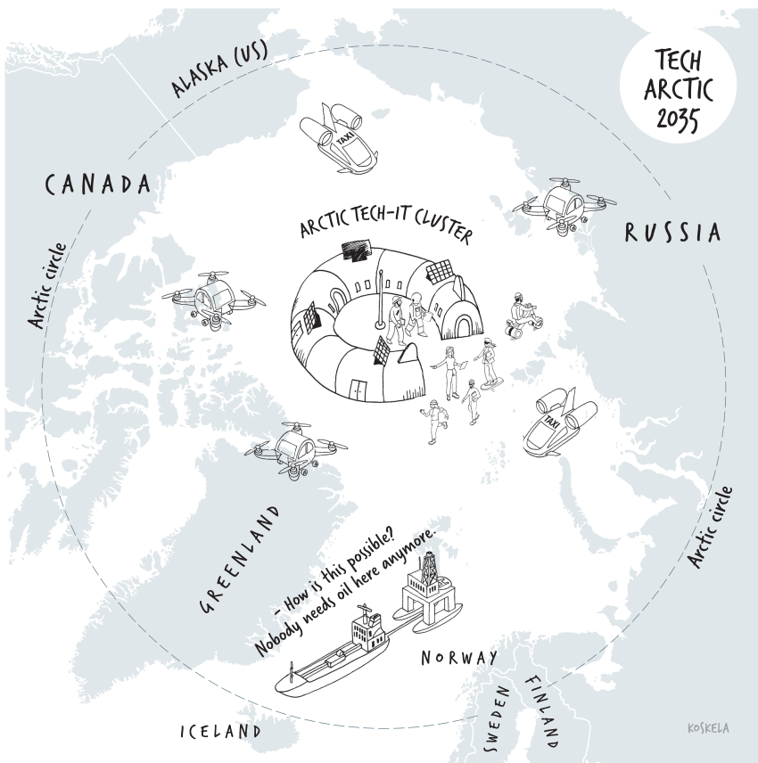
Figure 1.3 Illustration of the Tech Arctic 2035.

Through patience and perseverance, China has managed to change the power dynamics, cooperation patterns, and commerce in the Arctic. In 2035,