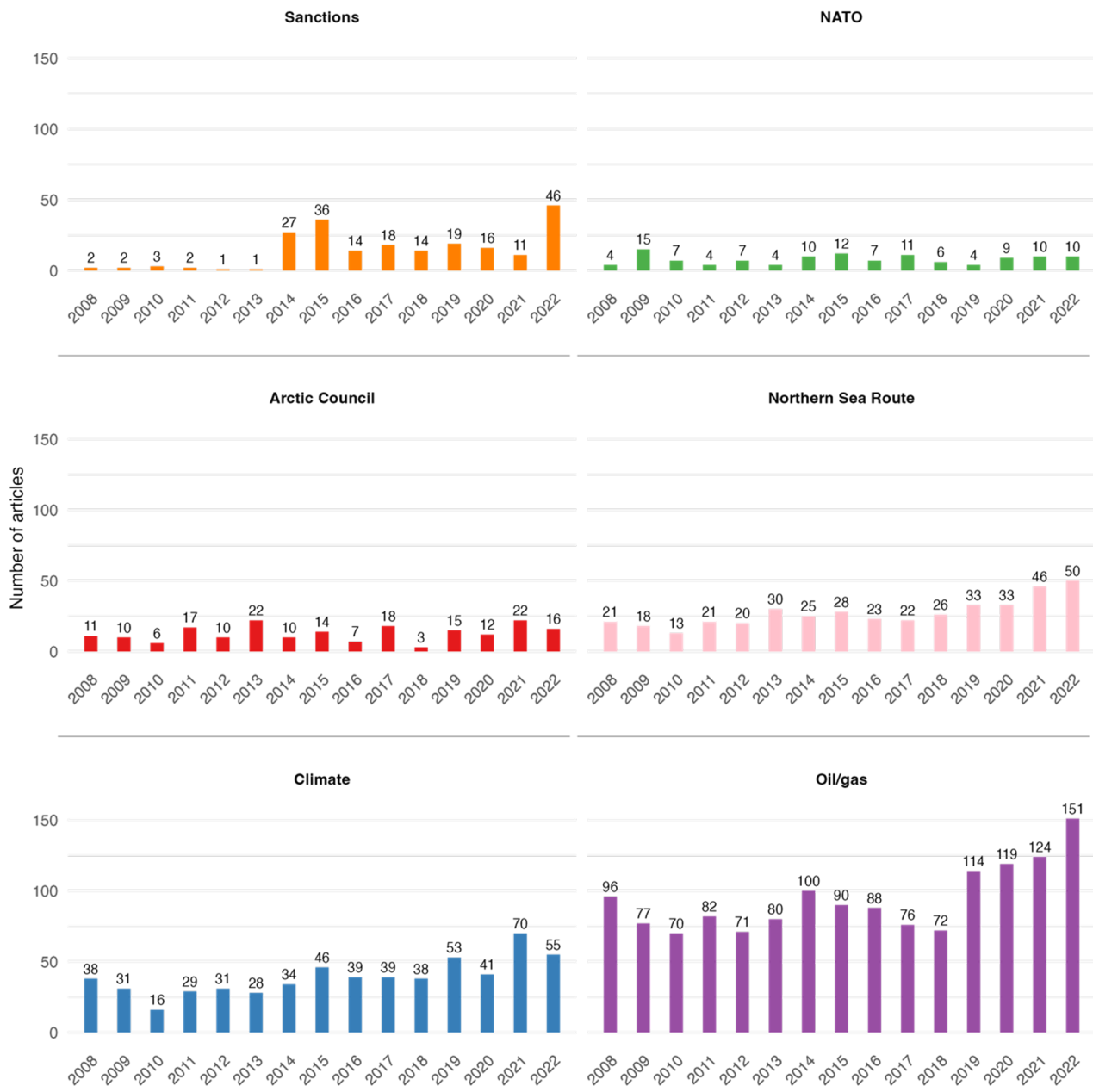
Figure 3. Themes in Rossiiskaya gazeta’s Arctic coverage

Summing up the different attention given to sanctions, NATO, Arctic council, the NSR, climate, and oil and gas in the articles about the Arctic published in Rossiiskaya gazeta between 2008 and 2022, Figure 3 illustrates how oil and gas (purple) stand out as the consistently most frequent topic, with climate (blue) in second place. Attention to sanctions (orange) emerged in 2014 and reached new heights in 2022. Furthermore, talks about the NSR (pink) have seen a steady increase throughout this period. The figure also illustrates a low number of references to NATO (green) and the Arctic Council (red).