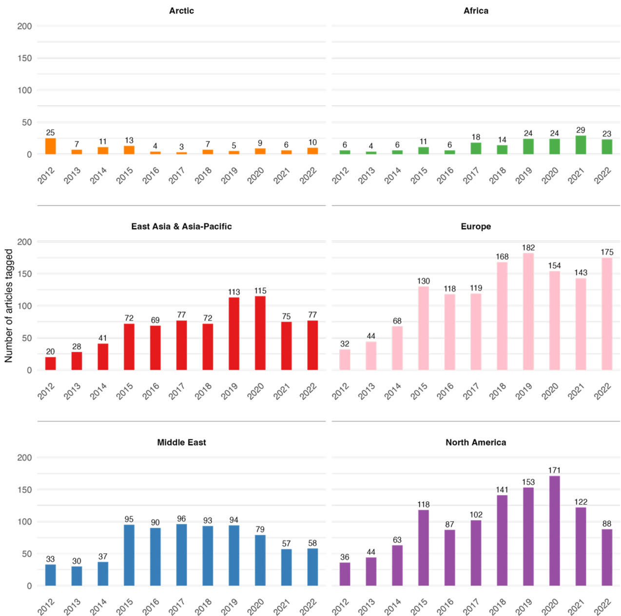
Figure 4. Frequency of region tags over time in RIAC

Unsurprisingly, the Arctic is not the primary interest of these analytical outlets. For example, RIAC has, between 2011 and early 2023, tagged 102 analytical articles as being concerned with the Arctic region, while Europe and North America both have more than 1,000 articles tagged (see Figure 4). Similarly, out of the more than 2,000 articles in RVGP, only 137 contain a mention of “Arctic”. Nonetheless, a review of their analyses of the Arctic provides us with insights into how the Arctic and the region’s role in international politics more broadly is presented by Russian experts.