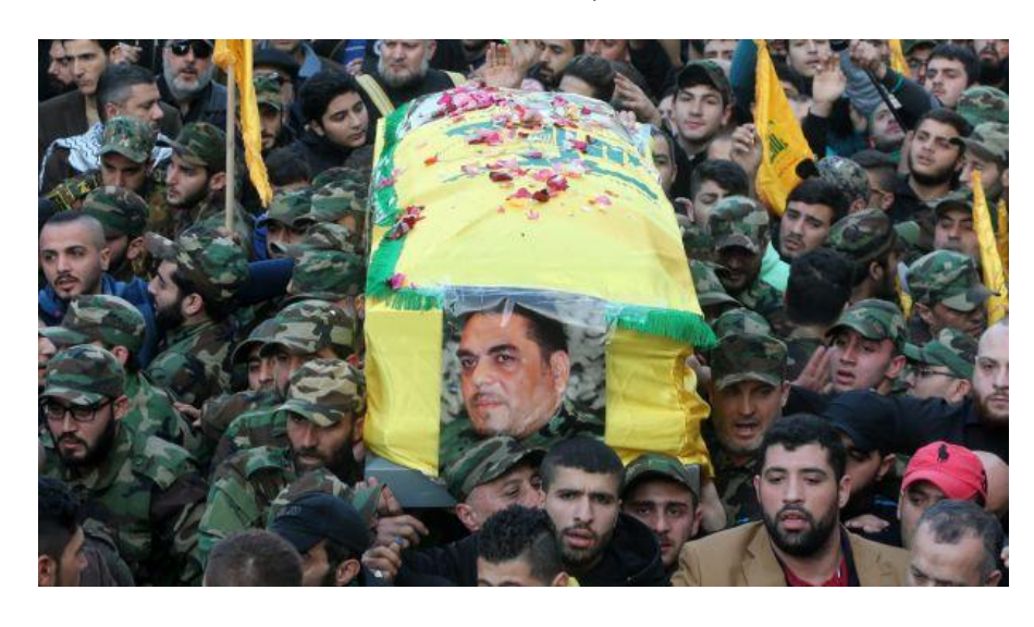
Figure 4. Funeral of Samir Kuntar, killed in Syria in December 2015