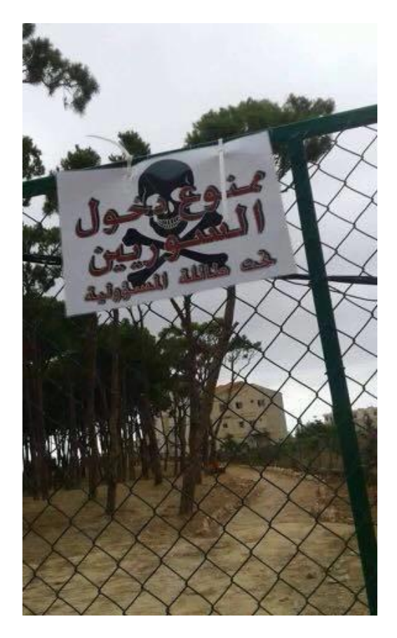
Figure 5. 'Syrians not welcome' (See note 20)