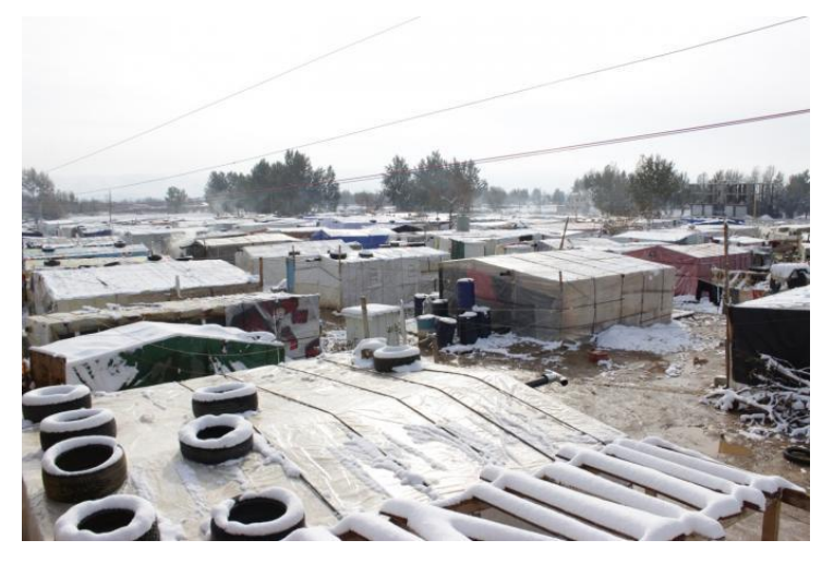
Figure 2. Informal tented settlement