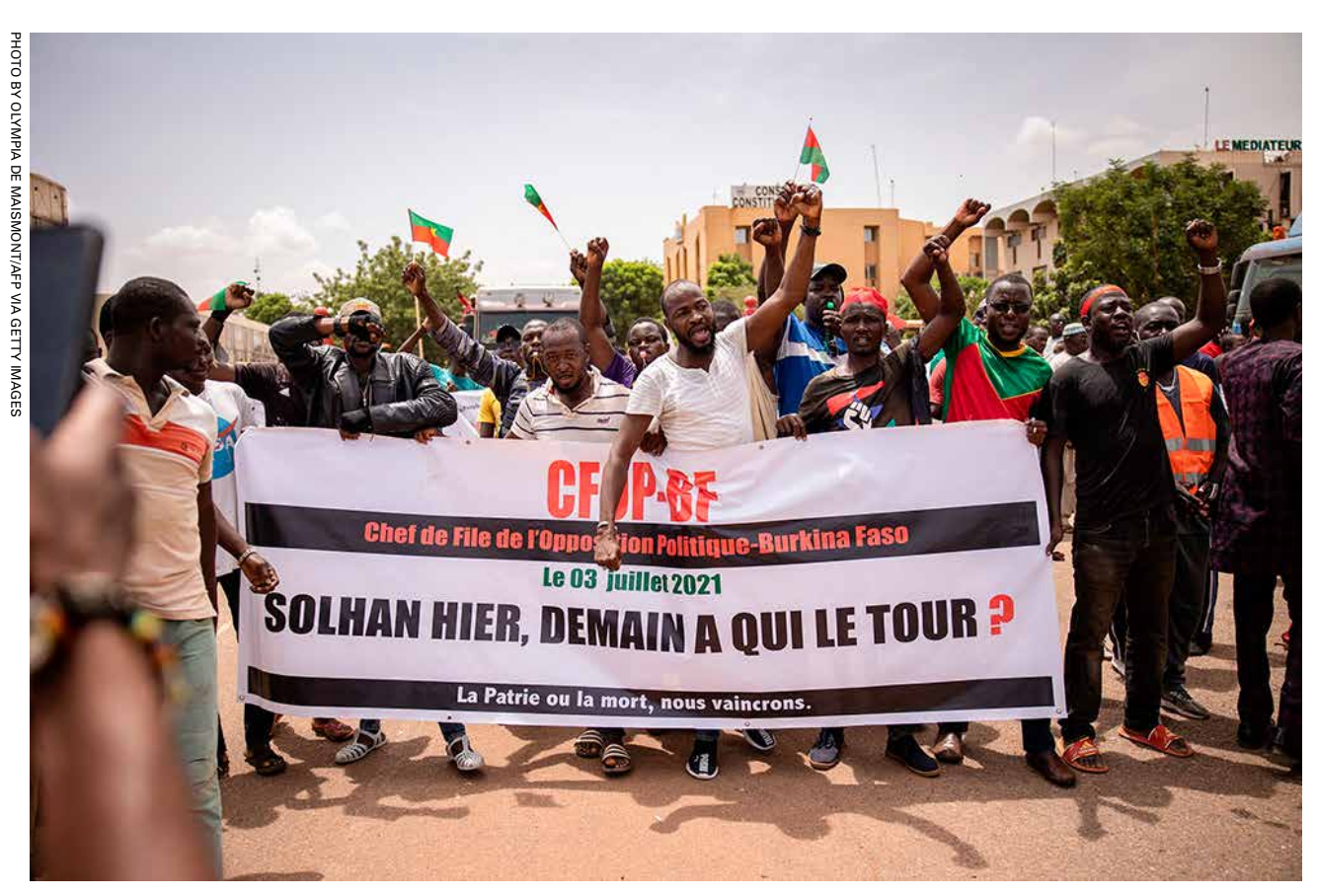
Demonstrators in Burkina Faso protest against the worsening security situation and demand a response for the jihadist attacks in Solhan, Ouagadougou (July 2021).

Militias are a double-edged sword as they can help strengthen the State's security network and support the SSF, but they also risk perpetuating conflict by exacerbating community tensions and violence. 15 As circumstances on the ground changed with the growing influence of jihadist