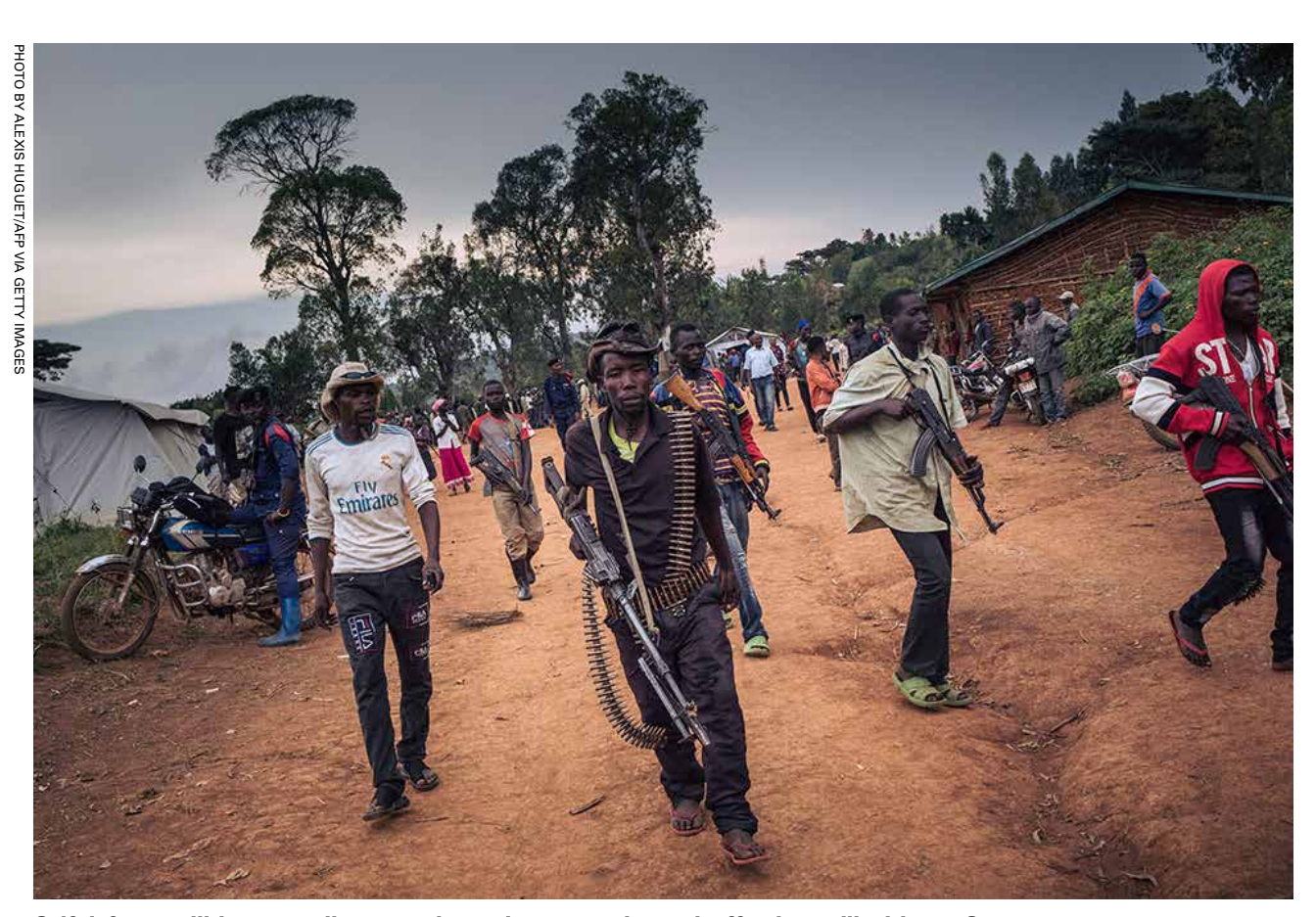
Self-defence militias generally act as alternatives to an absent, ineffective or illegitimate State.

MILITIAS OFTEN CLAIM TO DEFEND AN ESTABLISHED POLITICAL OR SOCIAL ORDER FROM INTERNAL AND EXTERNAL THREATS, AS OPPOSED TO REBELS WHO ARE USING VIOLENCE TO ACHIEVE REVOLUTIONARY SOCIAL AND POLITICAL CHANGE