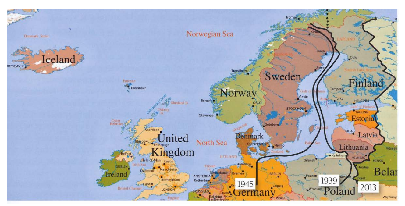
Map of the shifting political borders in Northern Europe since 1939

The long term challenge for the Nordic countries is to define their role and place in a changing Europe and a new East-West environment, between Germany to the South and Russia to the East. If