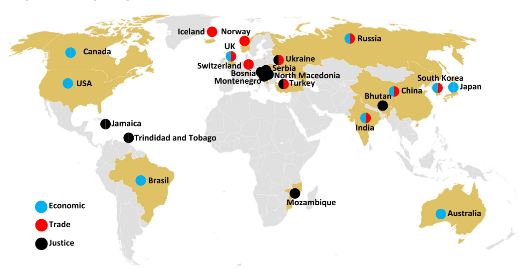
Figure 1: Top 10 Countries Within Each Perspective. [Colour figure can be viewed at wileyonlinelibrary.com]

Source: See Table A1. Notes: Beige indicates countries that are relevant for the carbon border adjustment mechanism in one way or another. Blue, red and black indicate in which way they are relevant.