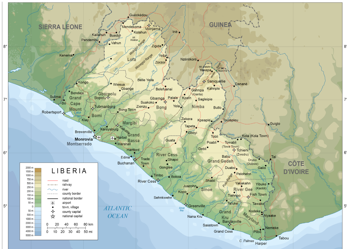
Topographic map of Liberia, Oona Räisänen